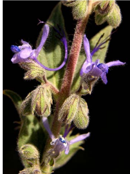
Vinegar Weed Trichostema lanceolatum Native Annual Mint Family