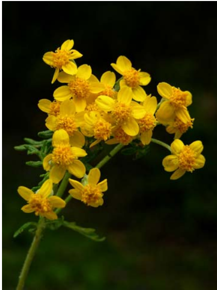
Golden Yarrow Eriophyllum confertiflorum var. confertiflorum Native Perennial Sunflower Family