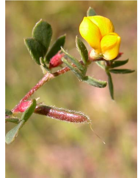
California Lotus Lotus wrangelianus Native Annual Pea Family