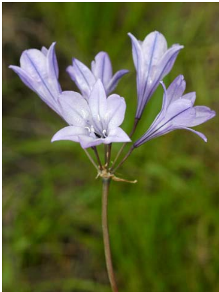
Ithuriel's Spear Triteleia laxa Native Perennial Lily Family