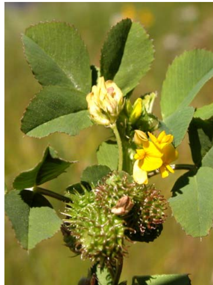
California Bur Clover Medicago polymorpha Introduced Annual Pea Family