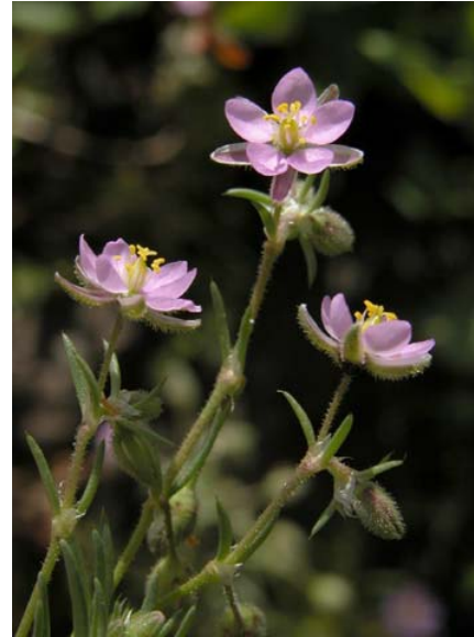
Ruby Sand Spurry Spergularia rubra Introduced Annual-Perennial Pink Family