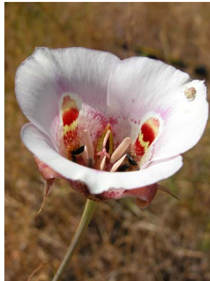
White Butterfly Mariposa Lily Calochortus venustus Native Perennial Lily Family