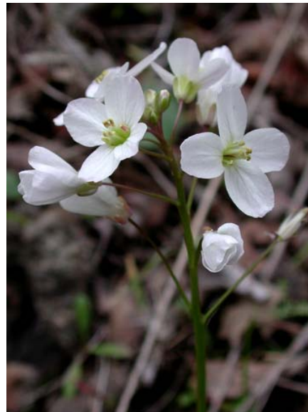
Milkmaids Cardamine californica Native Perennial Mustard Family