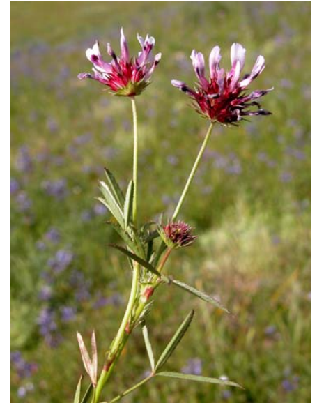
Tomcat Clover Trifolium willdenovii Native Annual Pea Family