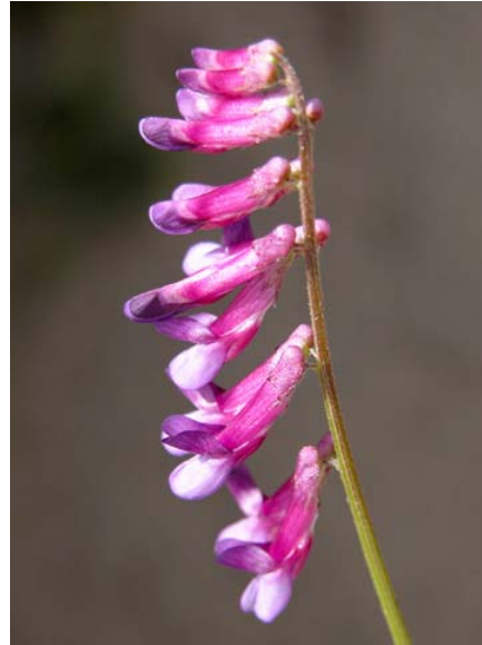
Winter Vetch Vicia villosa ssp. varia Introduced Annual-Biennial Pea Family