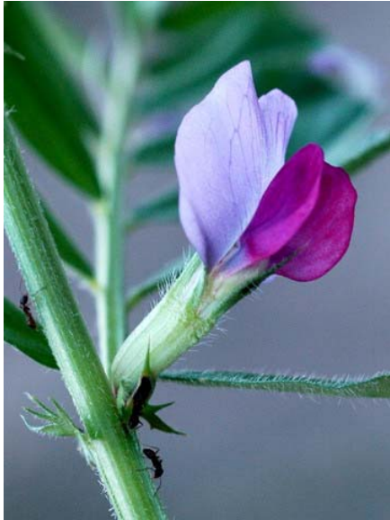
Spring Vetch Vicia sativa ssp. sativa Introduced Annual Pea Family