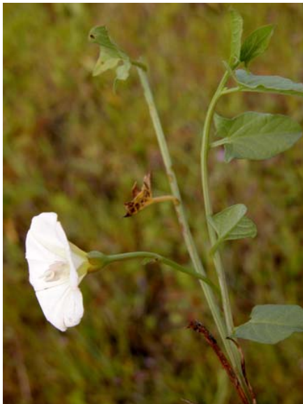
Field Bindweed Convolvulus arvensis Introduced Perennial Morning-Glory Family