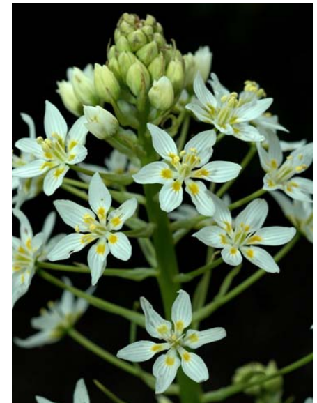
Common Star Lily Zigadenus fremontii Native Perennial Lily Family