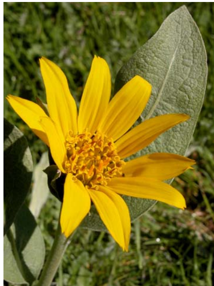
Gray Mule's Ear Wyethia helenioides Native Perennial Sunflower Family