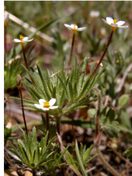
Bicolor Linanthus Linanthus bicolor Native Annual Phlox Family