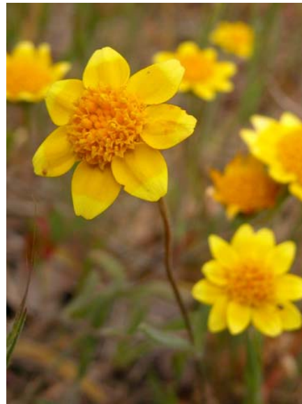
Goldfields Lasthenia californica Native Annual Sunflower Family