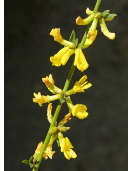
Deerweed Lotus scoparius var. scoparius Native Perennial Pea Family