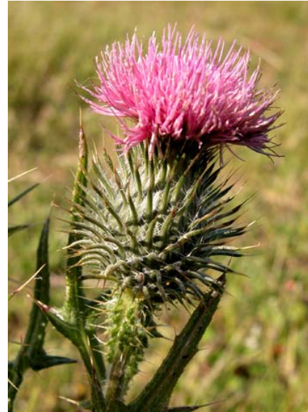
Bull Thistle Cirsium vulgare Introduced Biennial Sunflower Family