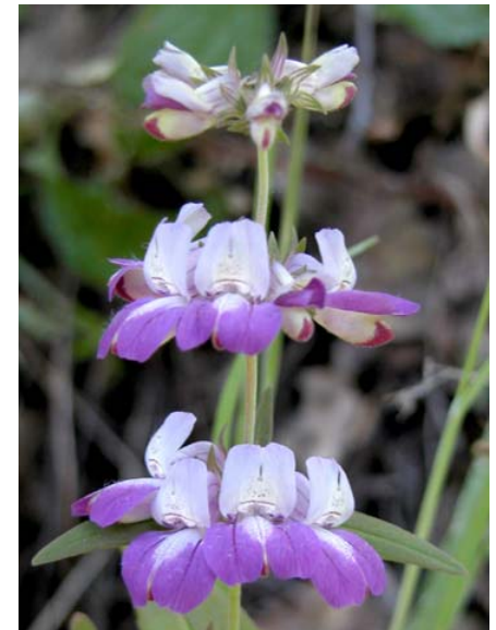
Chinese Houses Collinsia heterophylla Native Annual Snapdragon Family