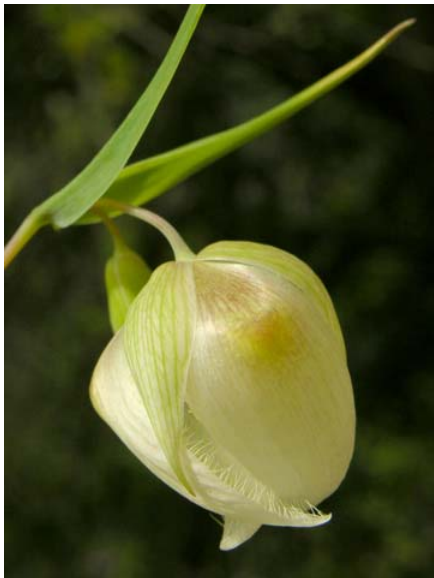
White Fairy Lantern Calochortus albus Native Perennial Lily Family