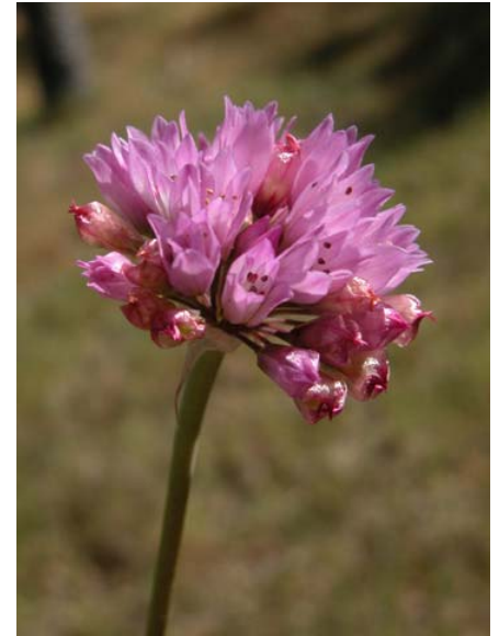
Pink / Serrated Onion Allium serra Native Perennial Lily Family