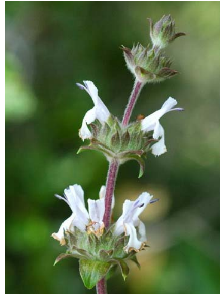
Black Sage Salvia mellifera Native Perennial Mint Family