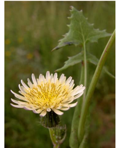
Common Sow Thistle Sonchus oleraceus Introduced Annual Sunflower Family