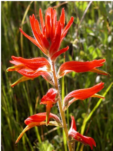
Common Indian Paintbrush Castilleja affinis ssp. affinis Native Perennial Snapdragon Family