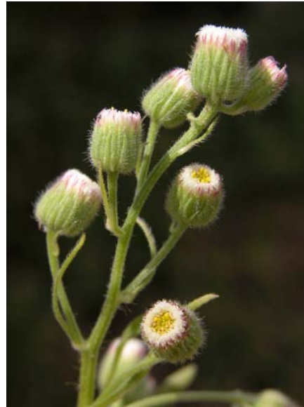
South American Horseweed Conyza bonariensis Introduced Annual Sunflower Family