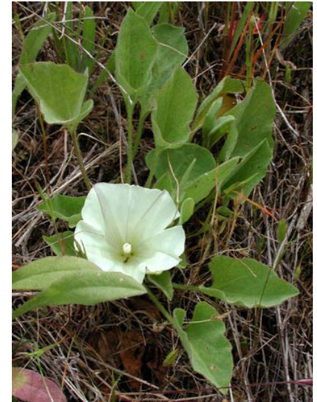
Shortstem Morning Glory Calystegia subacaulis ssp. subacaulis Native Perennial Morning-Glory Family