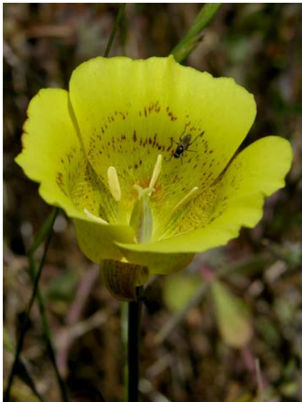
Yellow Mariposa Lily Calochortus luteus Native Perennial Lily Family