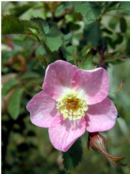
California Wild Rose Rosa californica Native Perennial Rose Family