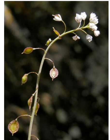
Hairy Fringe-pod Thysanocarpus curvipes Native Annual Mustard Family