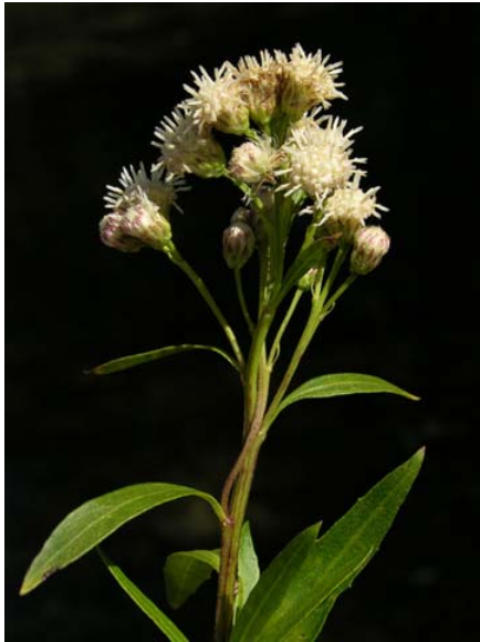
Mulefat Baccharis salicifolia Native Perennial Sunflower Family