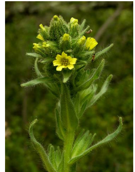
Common / Coast Tarweed Madia sativa Native Annual Sunflower Family