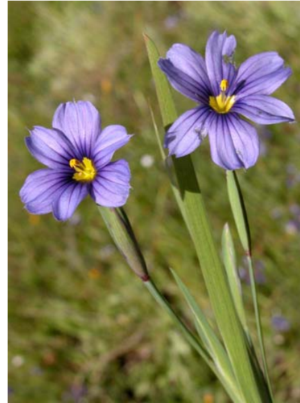
Blue-eyed Grass Sisyrinchium bellum Native Perennial Iris Family