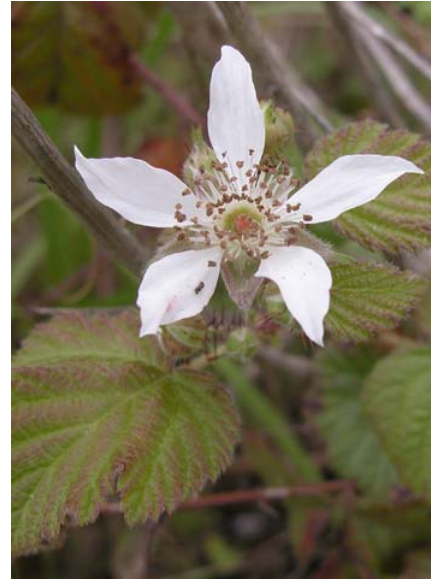
Native California Blackberry Rubus ursinus Native Perennial Rose Family