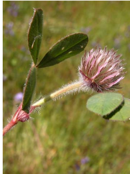
Rose Clover Trifolium hirtum Introduced Annual Pea Family