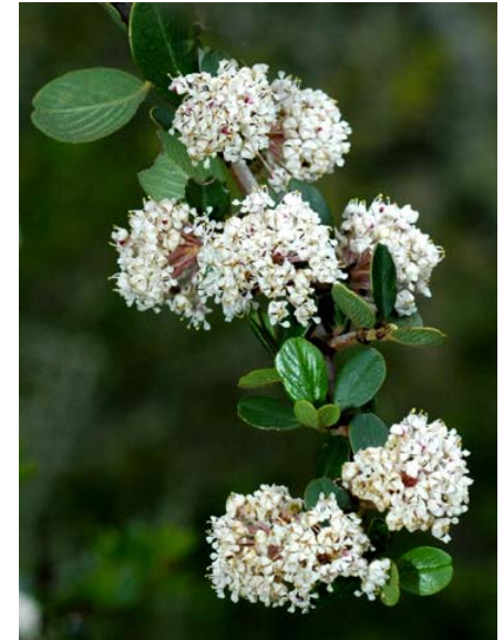
Buckbrush Ceanothus cuneatus var. cuneatus Native Perennial Buckthorn Family