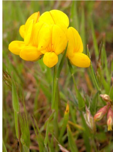
Bird's-foot Deerweed Lotus corniculatus Introduced Perennial Pea Family