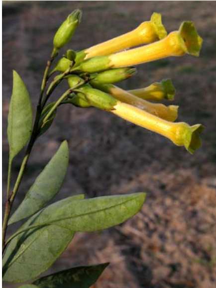
Tree Tobacco Nicotiana glauca Introduced Perennial Nightshade Family