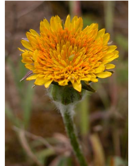
Large-flower Native Dandelion Agoseris grandiflora Native Perennial Sunflower Family