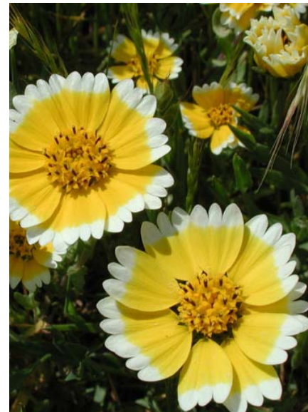
Common Tidytip Layia platyglossa Native Annual Sunflower Family