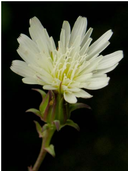
California White Chicory Rafinesquia californica Native Annual Sunflower Family