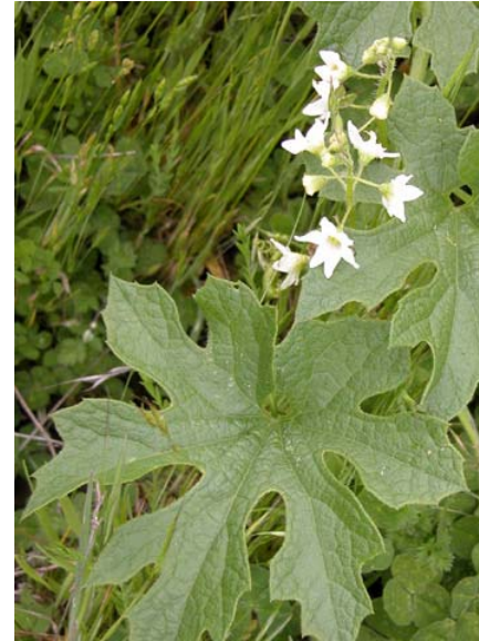
Oregon / Coast Manroot Marah oregonus Native Perennial Gourd Family