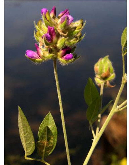
California Tea Rupertia physodes Native Perennial Pea Family