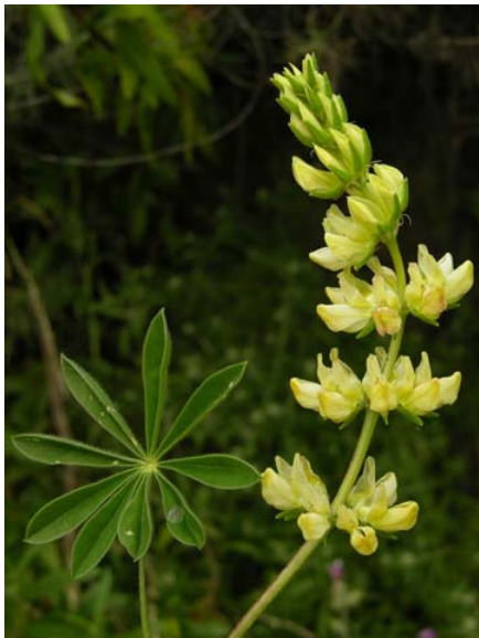
Gully Lupine Lupinus microcarpus var. densiflorus Native Annual Pea Family