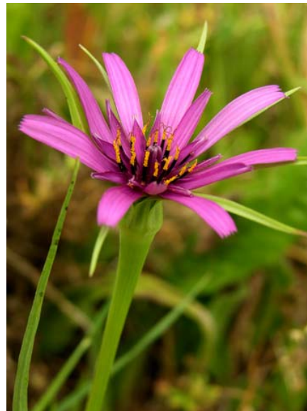
Purple Salsify Tragopogon porrifolius Introduced Biennial-Perennial Sunflower Family