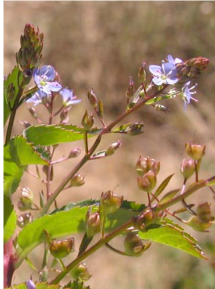
American Brooklime Speedwell Veronica americana Native Perennial Snapdragon Family