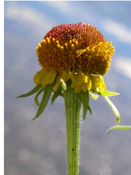
Rosilla Helenium puberulum Native Biennial Sunflower Family