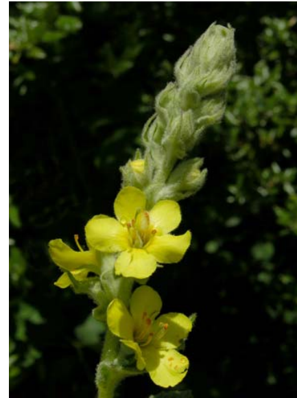
Common Woolly Mullein Verbascum thapsus Introduced Biennial Snapdragon Family