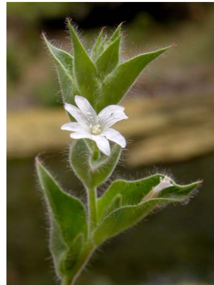
Dense-flower Willowherb Epilobium densiflorum Native Annual Evening Primrose Family