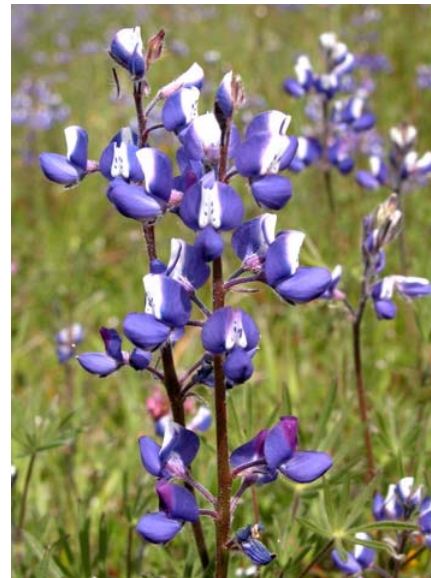
Miniature Dove Lupine Lupinus bicolor Native Annual Pea Family