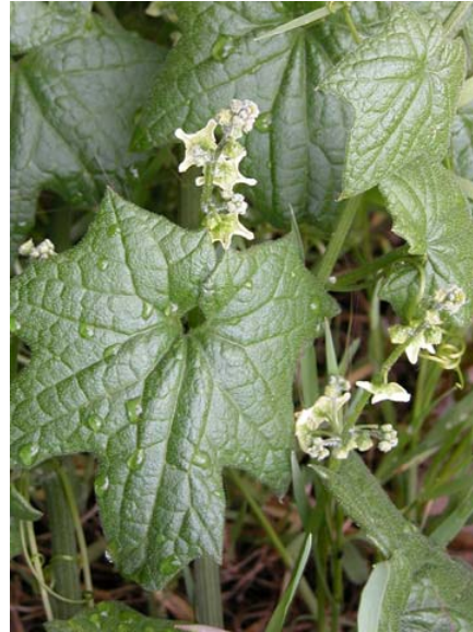
Common / California Manroot Marah fabaceus Native Perennial Gourd Family