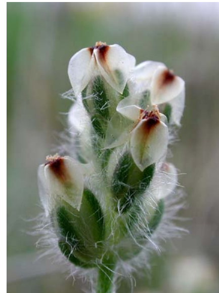
California Dwarf Plantain Plantago erecta Native Annual Plantain Family