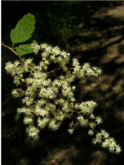
Creambush / Ocean Spray Holodiscus discolor Native Perennial Rose Family