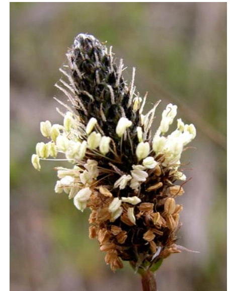
English Plantain Plantago lanceolata Introduced Annual Plantain Family