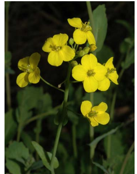
Yellow Field Mustard Brassica rapa Introduced Annual Mustard Family