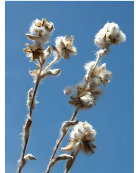
Slender Cottonweed Micropus californicus var. californicus Native Annual Sunflower Family