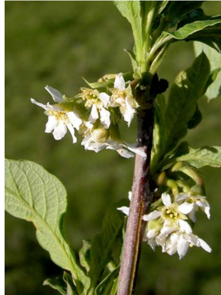
Oso Berry Oemleria cerasiformis Native Perennial Rose Family