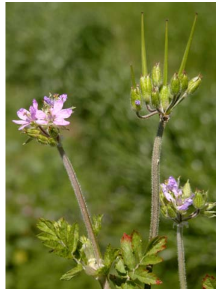
White-stem Filaree Erodium moschatum Introduced Annual Geranium Family