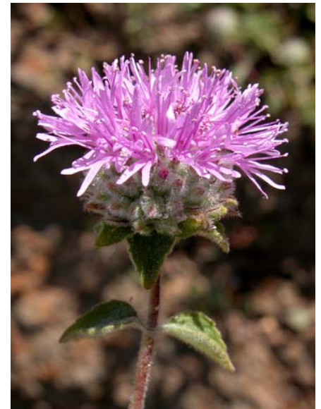
Common Coyotemint Monardella villosa ssp. villosa Native Perennial Mint Family