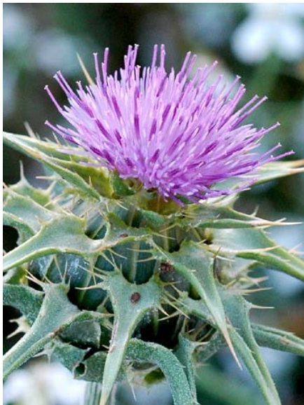
Milk Thistle Silybum marianum Introduced Annual-Biennial Sunflower Family