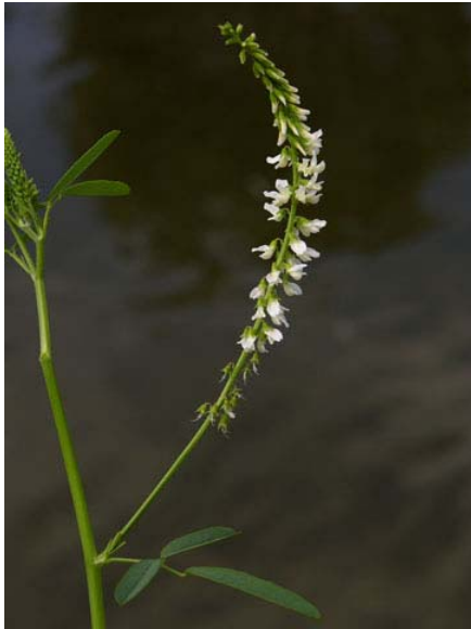
White Sweet Clover Melilotus alba Introduced Annual-Biennial Pea Family