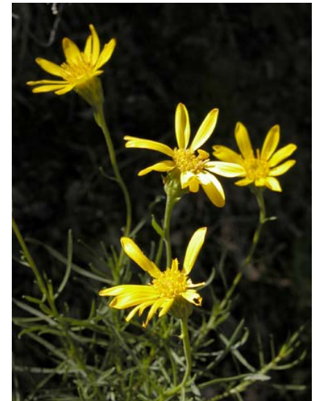
Interior Golden Bush Ericameria linearifolia Native Perennial Sunflower Family