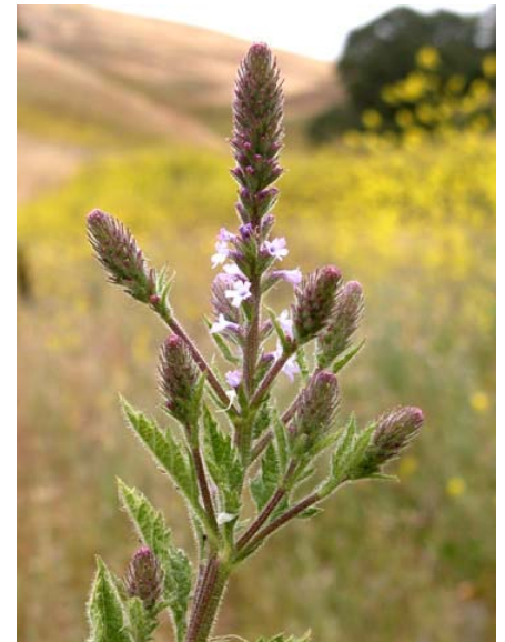
Robust Vervain Verbena lasiostachys var. scabrida Native Perennial Vervain Family