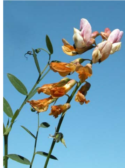
Pale Purple Pacific Pea Lathyrus vestitus var. vestitus Native Perennial Pea Family