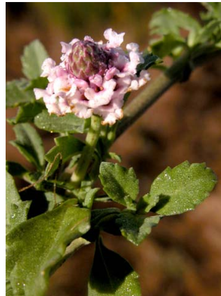
Lemon Verbena Phyla nodiflora var. nodiflora Native Perennial Vervain Family