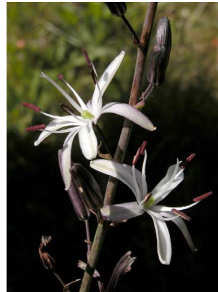
Common Soap Plant Chlorogalum pomeridianum var. pomeridianum Native Perennial Lily Family