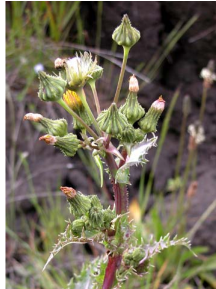
Prickly Sow Thistle Sonchus asper ssp. asper Introduced Annual Sunflower Family