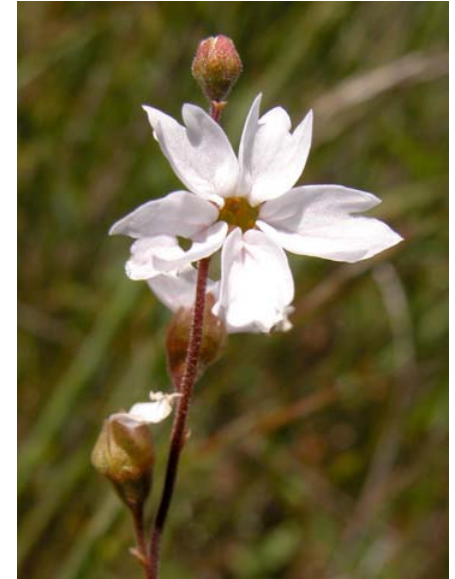
Woodland Star Lithophragma affine Native Perennial Saxifrage Family