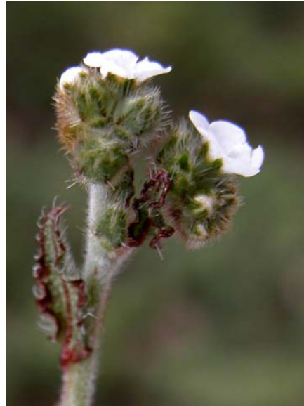
Nievitas Popcorn Flower Plagiobothrys nothofulvus Native Annual Borage Family