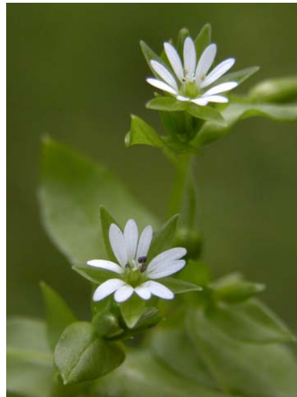
Common Chickweed Stellaria media Introduced Annual Pink Family