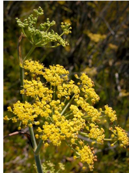
Sweet Fennel Foeniculum vulgare Introduced Perennial Carrot Family