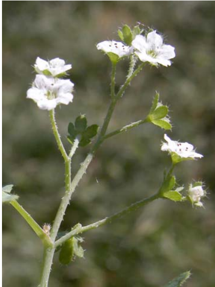
White Fiesta Flower Pholistoma membranaceum Native Annual Waterleaf Family