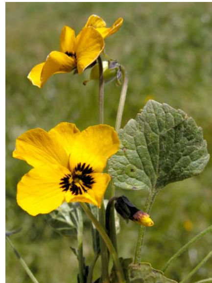
Johnny-Jump-Up / Wild Pansy Viola pedunculata Native Perennial Violet Family