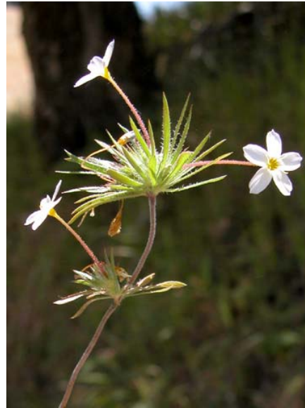
Pinklobe Linanthus Linanthus androsaceus Native Annual Phlox Family