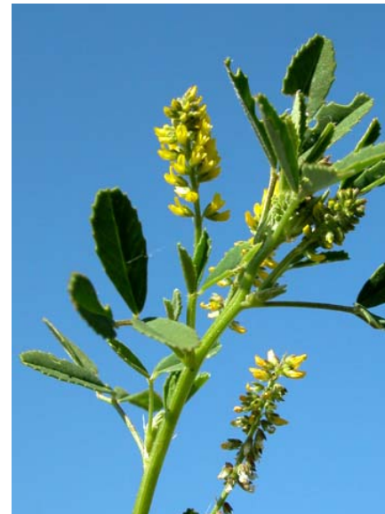
Sour Clover Melilotus indica Introduced Annual-Biennial Pea Family