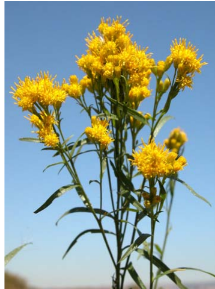
Western Goldenrod Euthamia occidentalis Native Perennial Sunflower Family