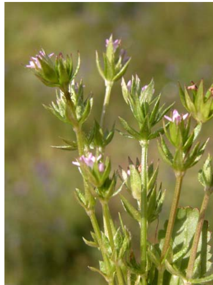
Blue Field Madder Sherardia arvensis Introduced Annual Madder Family