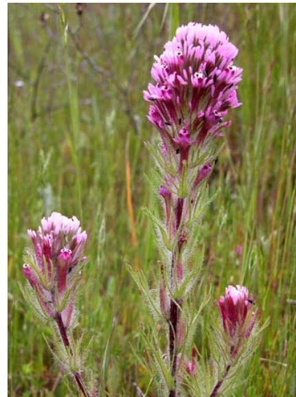
Purple Owl's Clover Castilleja exserta ssp. exserta Native Annual Snapdragon Family