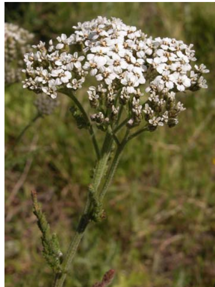
Yarrow Achillea millefolium Native Perennial Sunflower Family