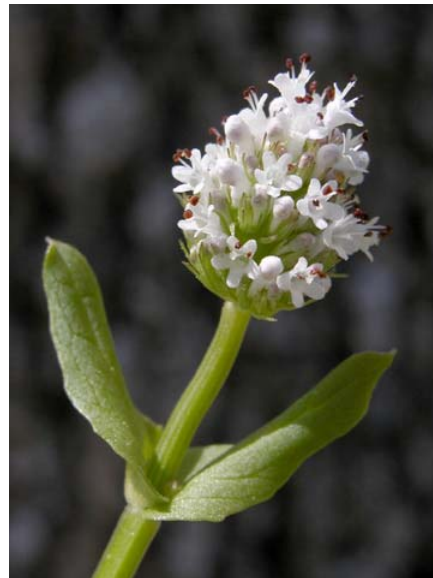
Longhorn Plectritis Plectritis macrocera Native Annual Valerian Family