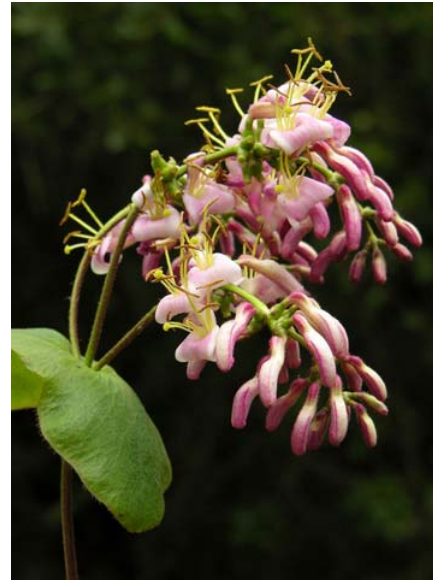
Hairy Vine Honeysuckle Lonicera hispidula var. vacillans Native Perennial Honeysuckle Family