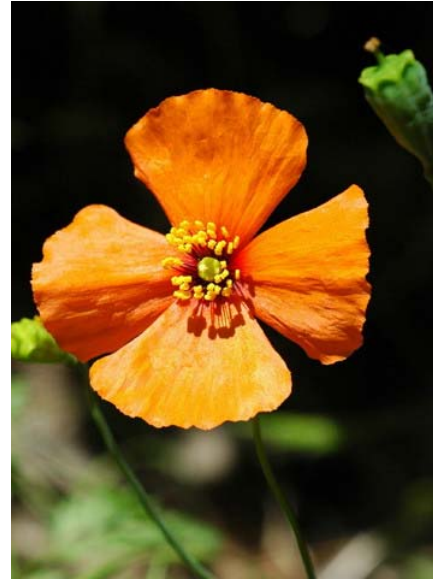
Wind Poppy Stylomecon heterophylla Native Annual Poppy Family