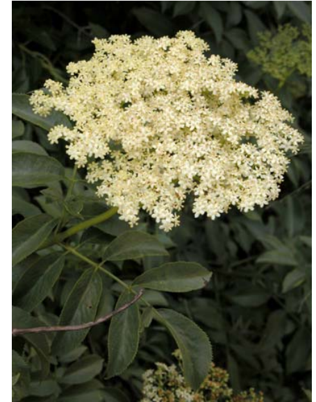
Blue Elderberry Sambucus mexicana Native Perennial Honeysuckle Family