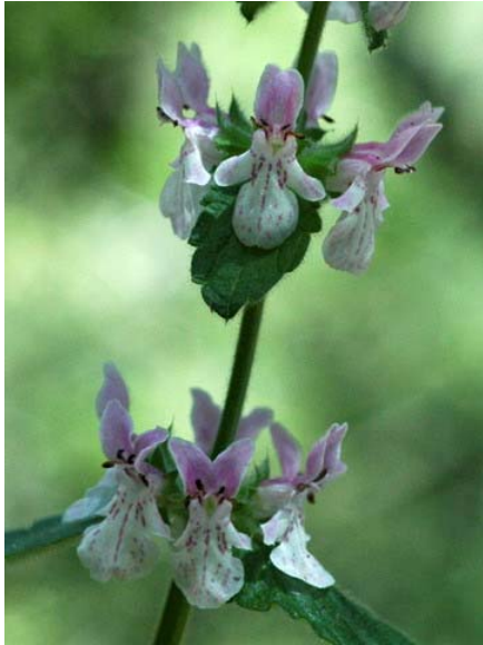
Common Rigid Hedge Nettle Stachys ajugoides var. rigida Native Perennial Mint Family