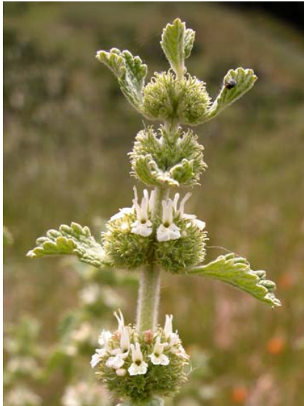
Common Horehound Marrubium vulgare Introduced Perennial Mint Family