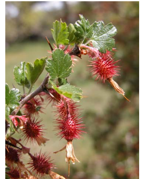
Hillside Gooseberry Ribes californicum var. californicum Native Perennial Gooseberry Family