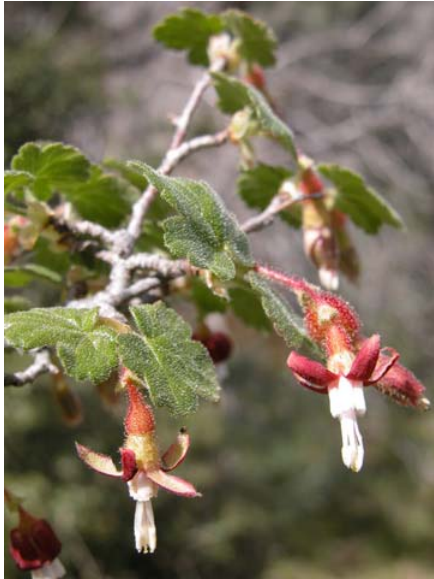
Canyon Gooseberry Ribes menziesii Native Perennial Gooseberry Family