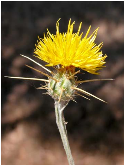
Yellow Star Thistle Centaurea solstitialis Introduced Annual Sunflower Family