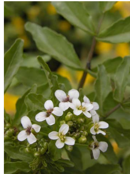
White Water Cress Rorippa nasturtium-aquaticum Native Perennial Mustard Family