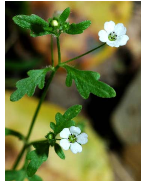
Variable-leaf Nemophila Nemophila heterophylla Native Annual Waterleaf Family