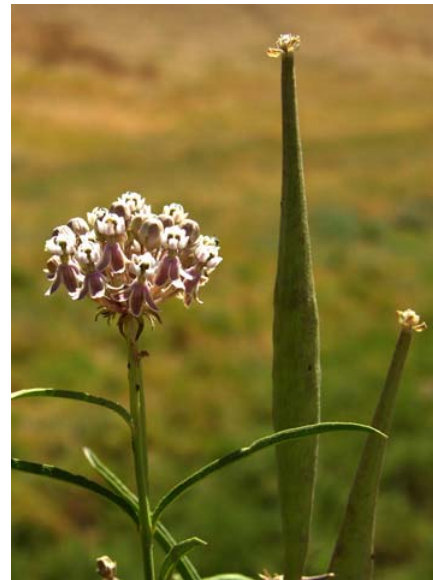
Whorled/Narrow-leaf Milkweed Asclepias fascicularis Native Perennial Milkweed Family