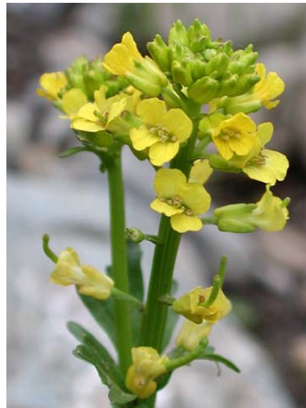
Erect-pod Winter Cress Barbarea orthoceras Native Perennial Mustard Family