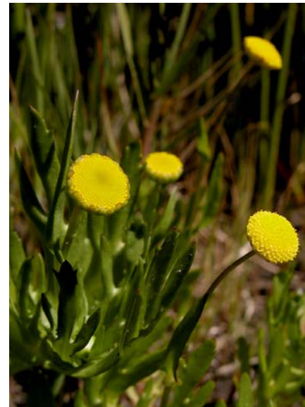
Brass Buttons Cotula coronopifolia Introduced Perennial Sunflower Family