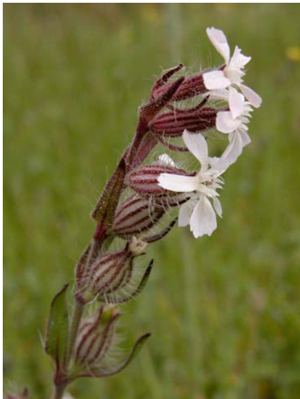
Windmill Pink Silene gallica Introduced Annual Pink Family