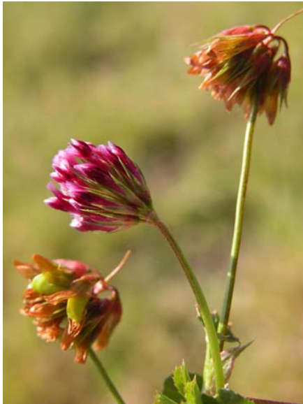
Pinpoint Clover Trifolium gracilentum var. gracilentum Native Annual Pea Family