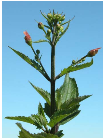
California Figwort Scrophularia californica ssp. californica Native Perennial Snapdragon Family