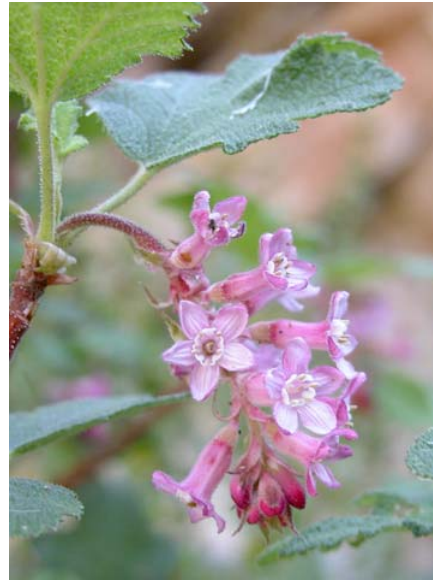
Chaparral Currant Ribes malvaceum var. malvaceum Native Perennial Gooseberry Family