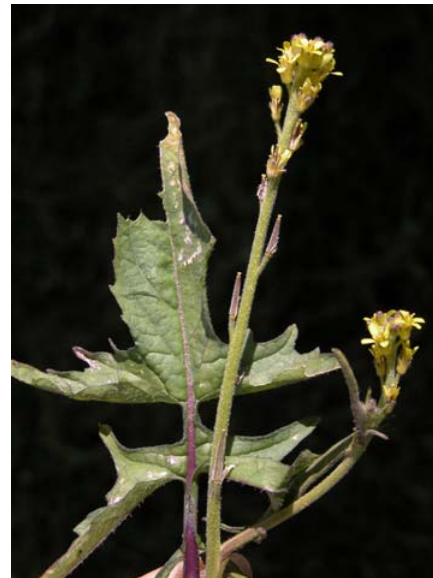
Black Mustard Brassica nigra Introduced Annual Mustard Family