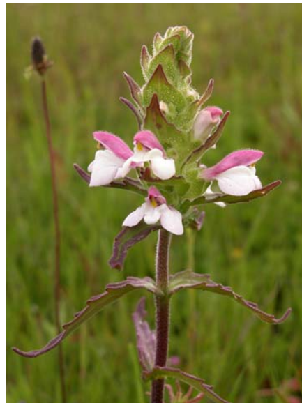
Bellardia Bellardia trixago Introduced Annual Snapdragon Family