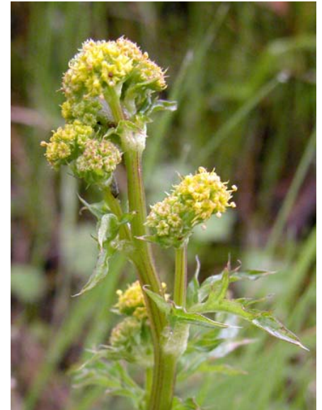
Pacific Woodland Sanicle Sanicula crassicaulis Native Perennial Carrot Family