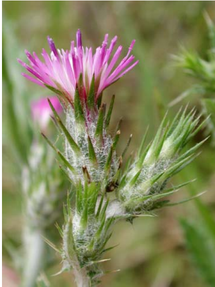
Italian Thistle Carduus pycnocephalus Introduced Annual Sunflower Family