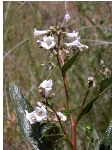
Yerba Santa Eriodictyon californicum Native Perennial Waterleaf Family