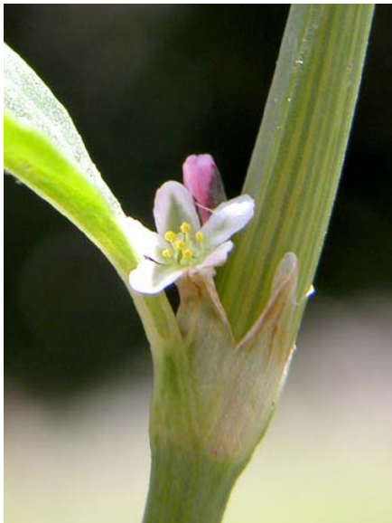
Common Yard Knotweed Polygonum arenastrum Introduced Annual Buckwheat Family