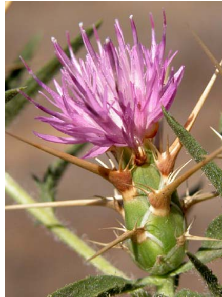
Purple Star Thistle Centaurea calcitrapa Introduced Annual-Biennial Sunflower Family