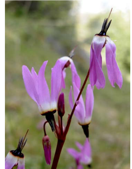
Mosquitobills Shooting Star Dodecatheon hendersonii Native Perennial Primrose Family