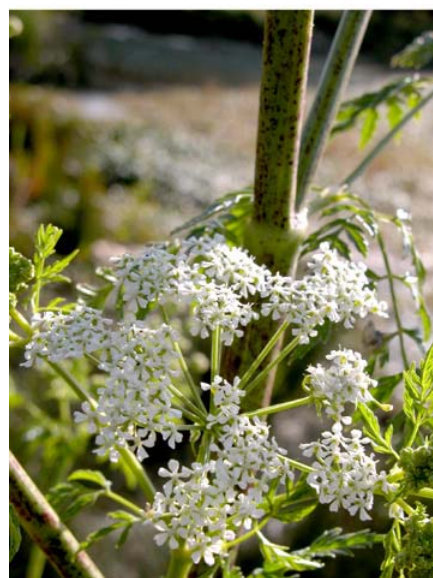
Poison Hemlock Conium maculatum Introduced Biennial Carrot Family