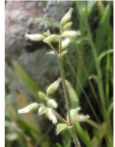
Mouse-ear Chickweed Cerastium glomeratum Introduced Annual Pink Family