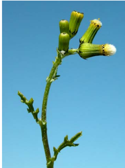
Common Groundsel Senecio vulgaris Introduced Annual Sunflower Family