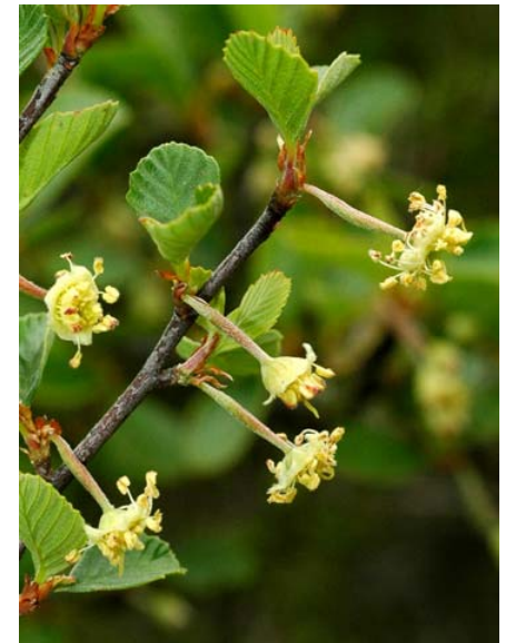
Birch-leaf Mt. Mahogany Cercocarpus betuloides var. betuloides Native Perennial Rose Family