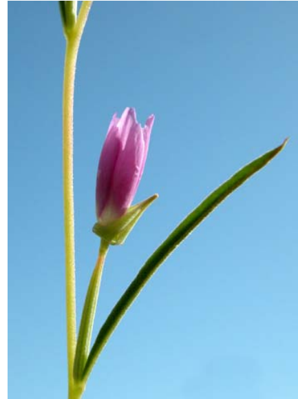
Small Clarkia Clarkia affinis Native Annual Evening Primrose Family