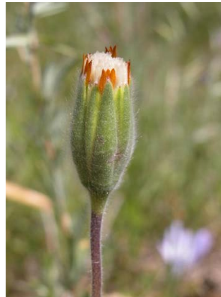
Blow Wives Achyrrachaena mollis Native Annual Sunflower Family