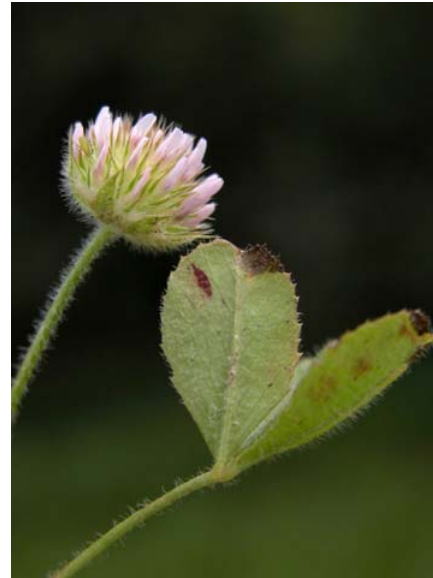
Small-head Clover Trifolium microcephalum Native Annual Pea Family